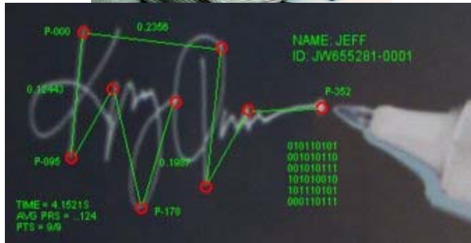
Figure 1: Dynamic Signature Depiction: As an individual signs the contact sensitive tablet, various measurements are observed and processed for comparison. 1,2

Most of the features used are dynamic characteristics rather than static and geometric characteristics, although some vendors also include these characteristics in their analyses. Common dynamic characteristics include the velocity, acceleration, timing, pressure, and direction of the signature strokes, all analyzed in the X, Y, and Z directions. Figure 2 illustrates these recorded dynamic characteristics of a signature. The X and Y position are used to show the changes in velocity in the respective directions (indicated by the white and yellow lines) while the Z direction (red line) is used to indicate changes in pressure with respect to time.