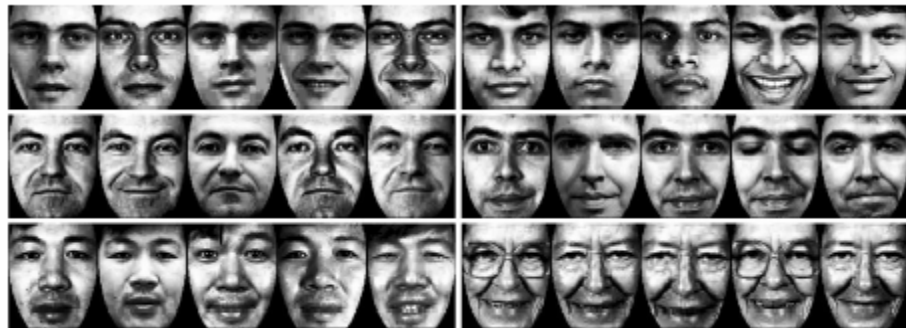
Figure 2: Example of Six Classes Using LDA 8

LDA is a statistical approach for classifying samples of unknown classes based on training samples with known classes. 4 (Figure 2) This technique aims to maximize between-class (i.e., across users) variance and minimize within-class (i.e., within user) variance. In Figure 2 where each block represents a class, there are large variances between classes, but little variance within classes. When dealing with high dimensional face data, this technique faces the small sample size problem that arises where there are a small number of available training samples compared to the dimensionality of the sample space. 7